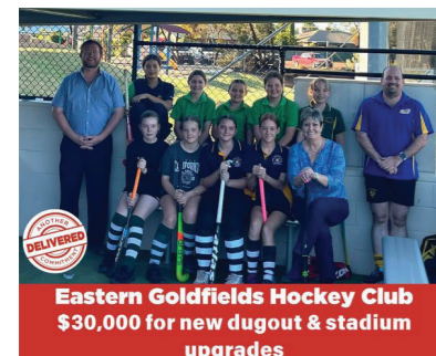
Eastern Goldfields Hockey Club $30,000 for new dugout & stadium upgrades