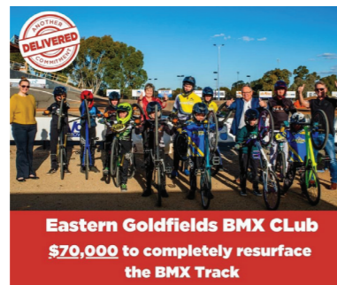
Eastern Goldfields BMX Club $70,000 to completely resurface the BMX Track